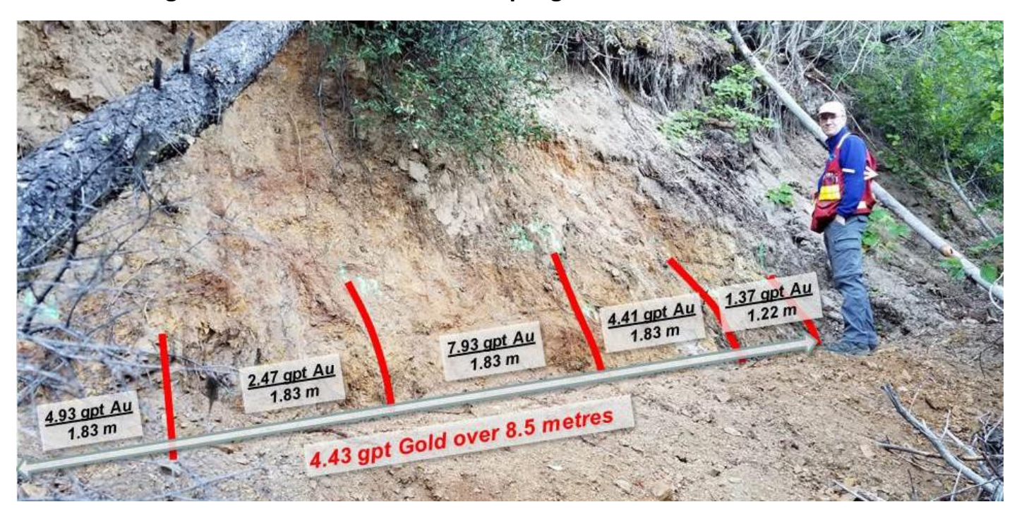
Figure 2: Bona Zone Channel sampling at the Treasure Shear Trend