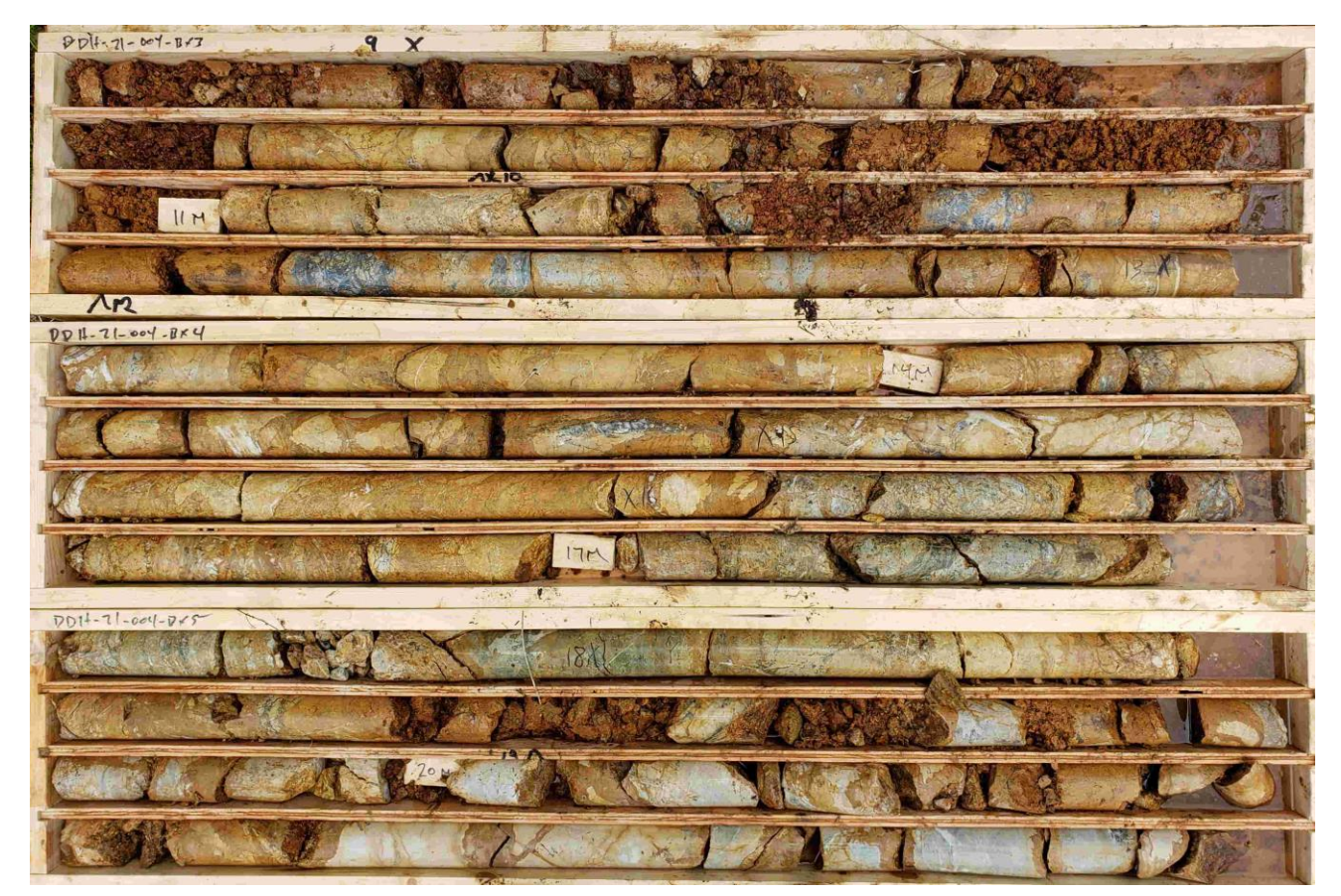
Figure 3: DDH 21-004 Core Photo of the Eagle Shear Zone